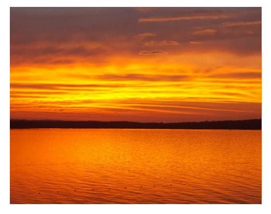
Friday, August 10, 2018